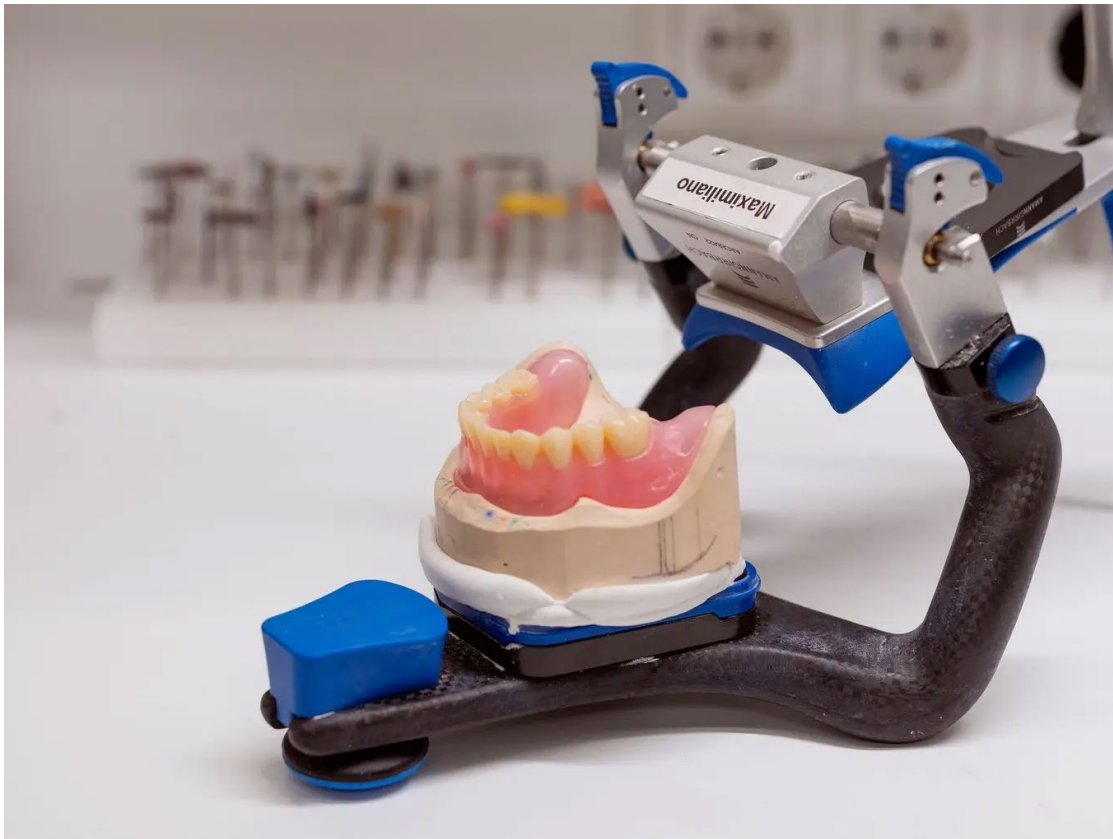
A finished mandibular denture printed in Denture Base Resin and Denture Teeth Resin.