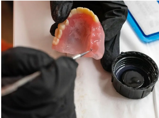
Assembly of denture base and denture teeth during post-processing using Denture Base Resin.

Every week, technicians in the lab produce between ten and twelve sets of hybrid dentures to be sent out to customers. If duplicate or travel dentures are needed, they often manufacture them completely through 3D printing. In such cases, both the denture bases and the denture teeth are 3D printed and precisely assembled during post-processing.