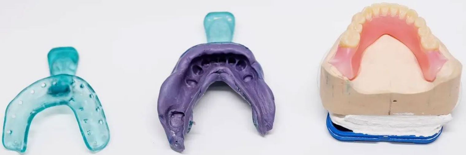
The workflow for producing digital dentures, from custom impression trays printed in Custom Tray Resin for taking traditional impressions, to a finished mandibular denture.

Guendler designs new dentures using the software exocad. If a duplicate is needed, he simply scans the existing denture or retrieves the file from the database, edits it in the software 3Shape, and directly prints it in Denture Base Resin and Denture Teeth Resin.