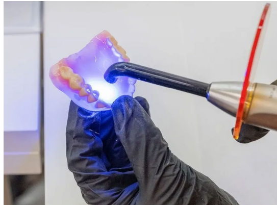
Denture assembly using dental adhesive and a polymerization lamp.

Since the dental lab is using their 3D printers daily for different applications, they rely on organized workflows to leverage the full capacity of the lab's two Form 3B+ printers. More and more denture bases are being printed overnight after Guendler creates the CAD design during the day. That leaves the 3D printers available to print denture teeth and crowns during the day, as well as appliances for the preparation of procedures, such as custom impression trays and models. "If I need to print denture teeth, for example, I do that during the day, as they are done within one and a half or maximum two hours, allowing me to continue my work," says Guendler.