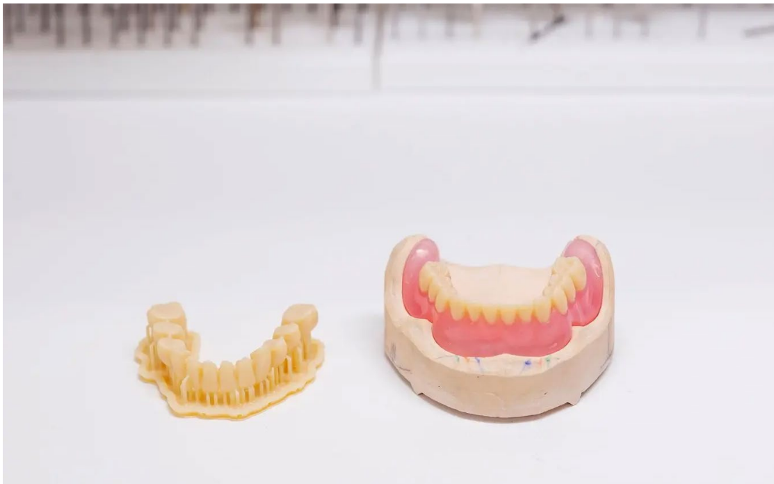
Left: 3D printed denture teeth made from Denture Teeth Resin. Right: 3D printed full mandibular denture made from Denture Base Resin and Denture Teeth Resin.